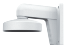
DS-1272ZJ-110-TRS Wall Mount