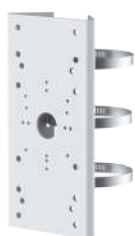
DS-1275ZJ-SUS Vertical Pole Mount